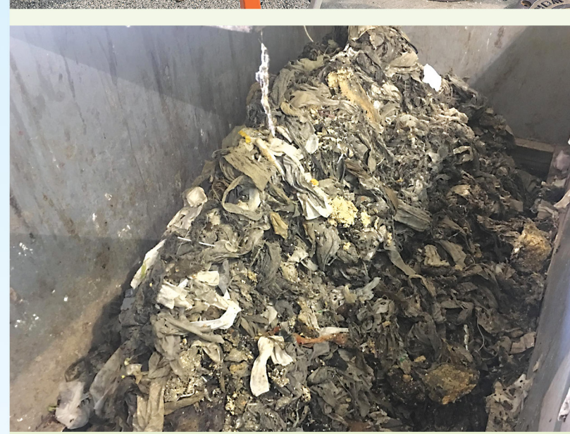
Used "flushable" wipes and other items removed from a sewer in Clinton Township by the Macomb County Public Works Office.